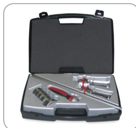
TMIP 30-60 Supplied with 2 extractors covering bore diameters from 30 to 60 mm (1,2 to 2,4 in)