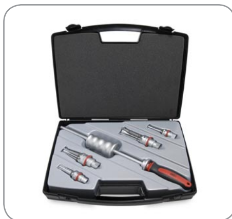
TMIP 7-28 Supplied with 4 extractors covering bore diameters from 7 to 28 mm (0,28 to 1,1 in)