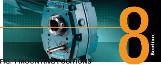
FIG. 1 MOUNTING POSITIONS