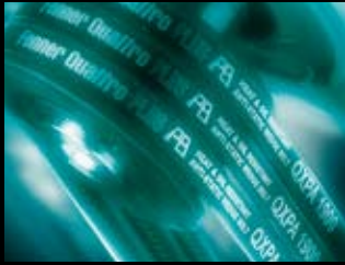
FRICTION BELT DRIVES