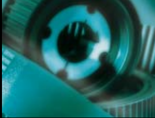
SYNCHRONOUS BELT DRIVES